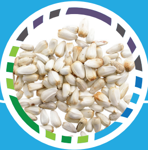
SEEDS & PLANT FRAGMENTS e.g. roots, rhizomes