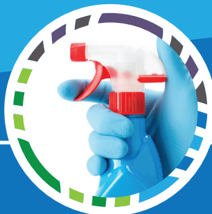
DISINFECT Some invasives are too small to be seen with the naked eye - thoroughly disinfect