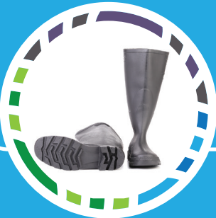
PPE e.g. boots, waders, clothing seams