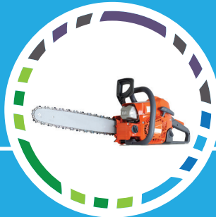
TOOLS e.g. saws, litter pickers, rope