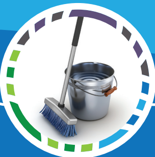
RINSE with clean water to remove all mud and debris