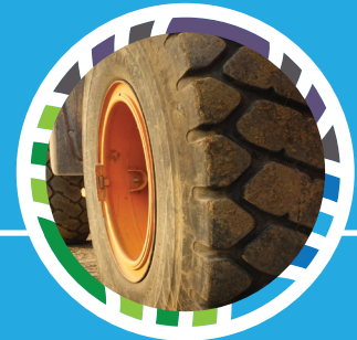
EQUIPMENT e.g. vehicle tyres, boats